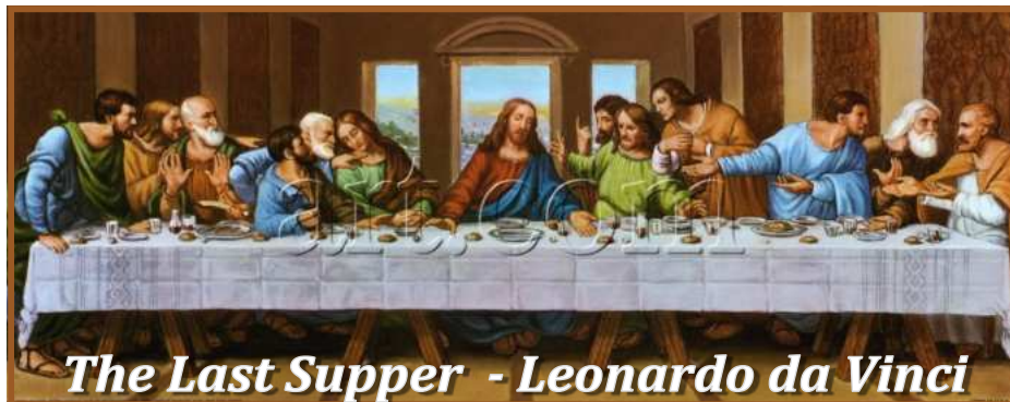
The Last Supper - Leonardo da Vinci

Commemorates the Eucharist (Holy Communion) instituted by Jesus at the Last Supper